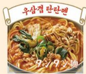
Beef Loin Dan Dan Noodle 9,000 won