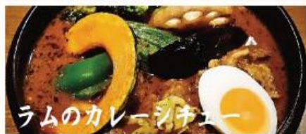
Hokkaido Style Lamb Curry

*With advanced reservation, choose 1 of the selected side dishes