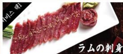
Premium Lamb Sashimi