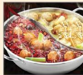
Sukiyaki Nabe (Beef Loin Stew) 20,000 won