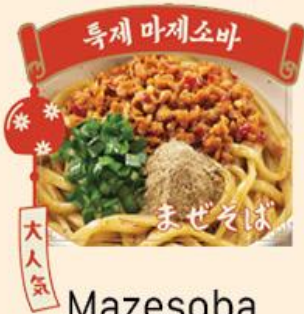
Mazesoba 9,000 won