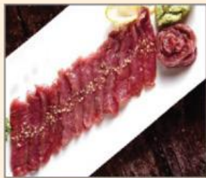
Premium Lamb Sashimi 15,000 won