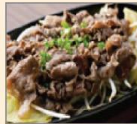
Beef Brisket with Sprout 16,000 won