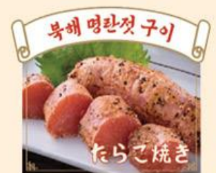
Grilled Salted Pollack Roe 9,000 won