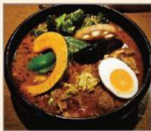
Hokkaido Style Lamb Curry 16,000 won