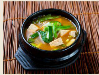
된장찌개 SOYBEAN PASTE STEW