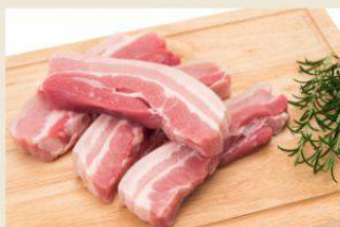
삼겹살 PORK BELLY 180g ₩14000

Side dishes, vegetables, and sauce are provided