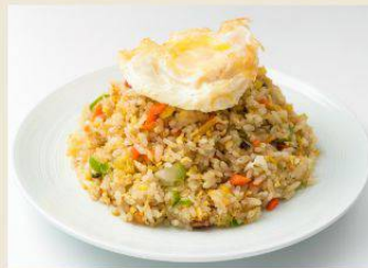
김치볶음밥 KIMCHI FRIED RICE ₩7000