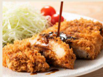
돈까스 PORK CUTLET