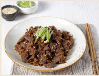
불고기덮밥 BEEF BULGOGI