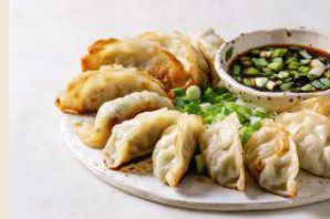
만두 YAKI MANDU 12 PCS ₩5000