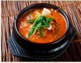
김치찌개 KIMCHI STEW